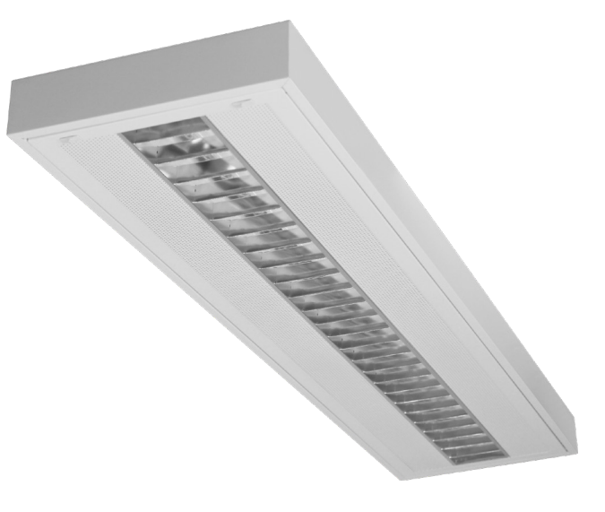
Designed for Universal Mounting in nominal 1200 x 300 T-Grid or Surface applications. Plaster trim available as a separate option.